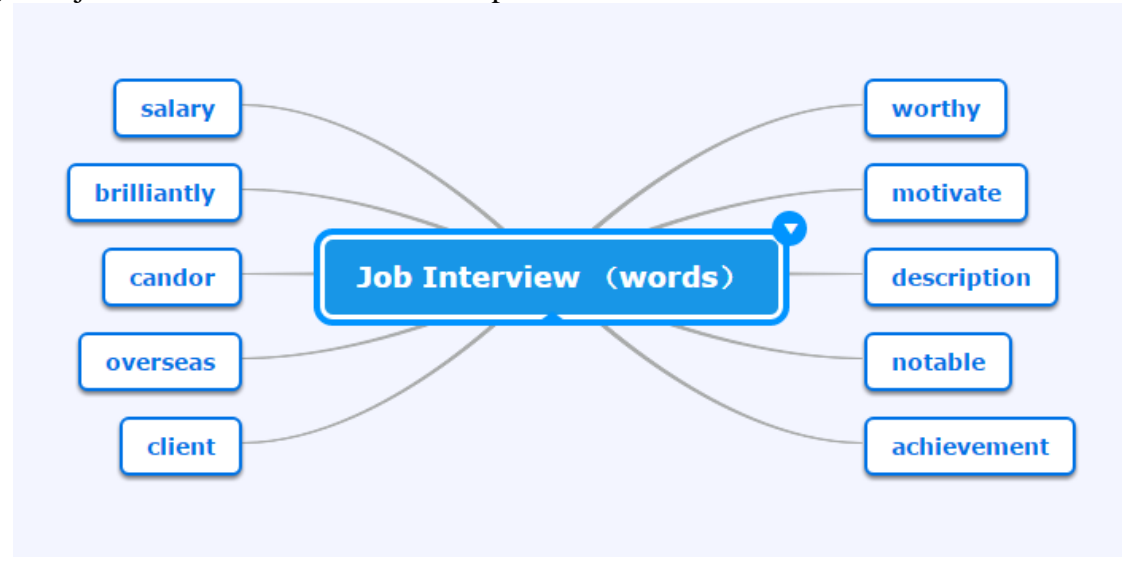
Fig.2 the mind map on job interview of words

Teachers use mind maps to summarize the words and expressions usually appeared in the dialogue of job interview. Here the mind map is as follows: